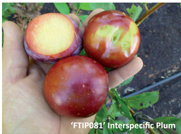
'FTIP081' Interspecific Plum. Stage 1 Evaluation page 12.