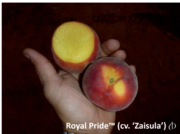
Royal Pride™ (cv. 'Zaisula') (b)

'FTP077' Peach. Stage 1 Evaluation page 18.