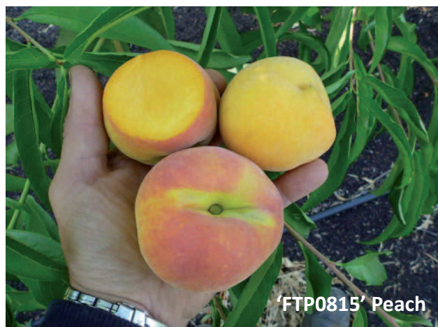
'FTP0815' Peach. Stage 1 Evaluation page 9.