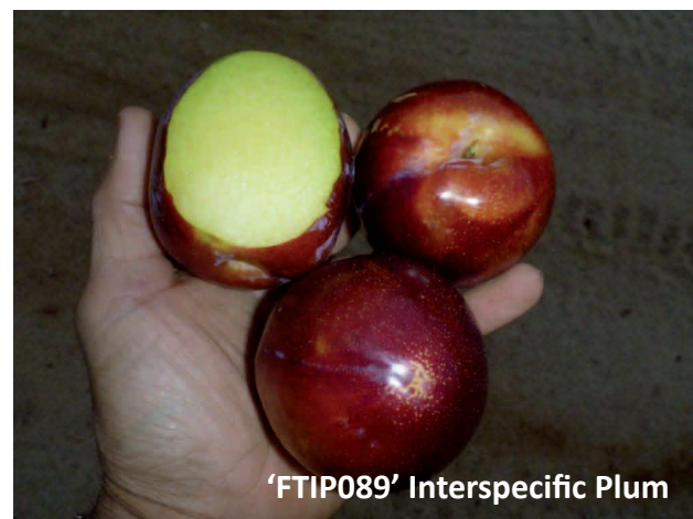
'FTIP089' Interspecific Plum. Stage 1 Evaluation page 7.

This project is funded by HAL through voluntary contributions from Graham's Factree Pty Ltd with matched funds from the Australian Government.