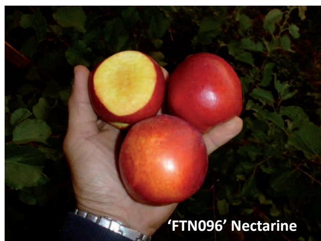
'FTN096' Nectarine. Stage 1 Evaluation page 11.