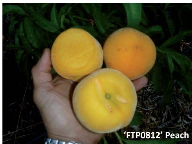
'FTP0812' Peach. Stage 1 Evaluation page 6.