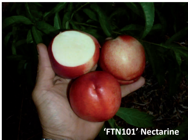
'FTN101' Nectarine. Stage 1 Evaluation page 4.

Welcome to the ninth edition of The Evaluation Facts for the 2011-2012 season. The Evaluation Facts is a regular newsletter keeping you in touch with the latest information from Graham's Factree's Cultivar Evaluation Project.