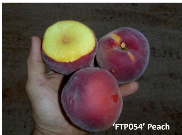
'FTP054' Peach. Stage 2 Evaluation page 8.