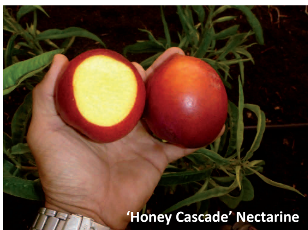
'Honey Cascade' Nectarine

'Honey Glo' Nectarine. Stage 1 Evaluation page 16.