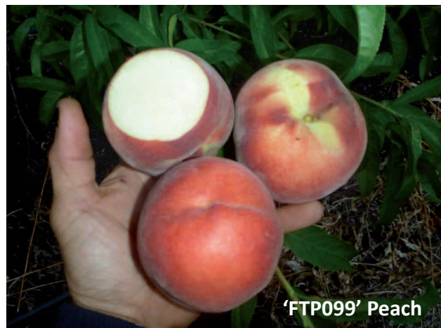
'FTP099' Peach. Stage 2 Evaluation page 5.