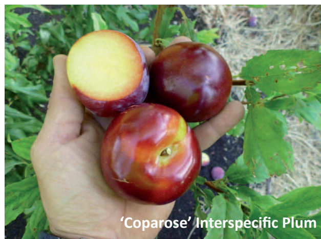
'Coparose' Interspecific Plum. Stage 1 Evaluation page 13.