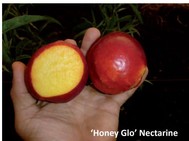
'Honey Glo' Nectarine

'FTN0112' Nectarine. Stage 1 Evaluation page 15.