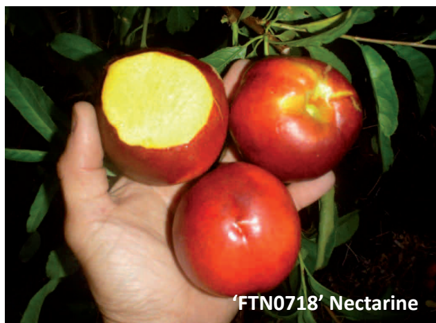
'FTN0718' Nectarine. Stage 1 Evaluation page 6.