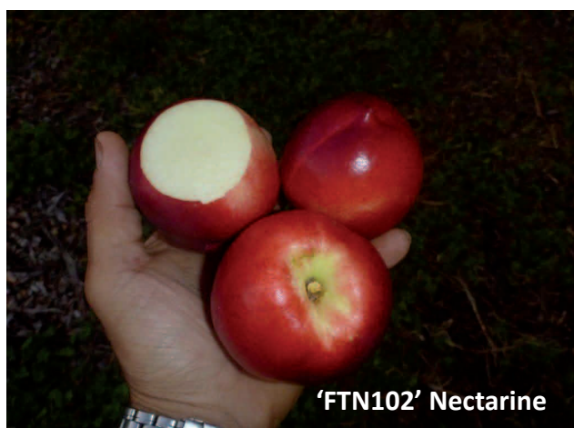
'FTN102' Nectarine. Stage 1 Evaluation page 8.