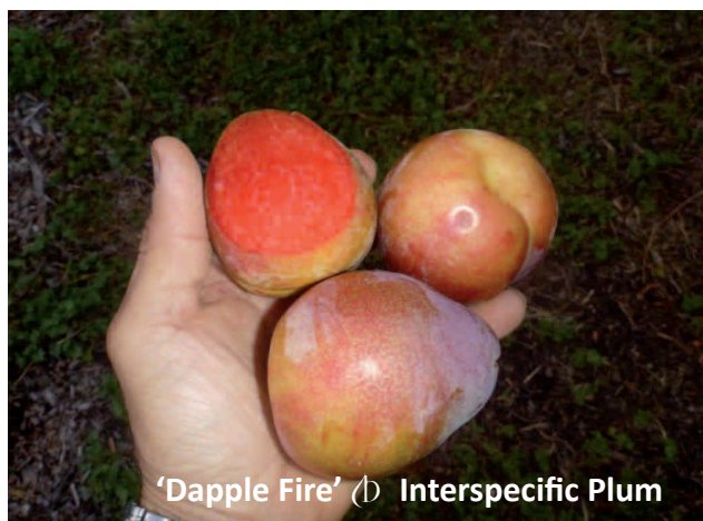
'Dapple Fire' (b) Interspecific Plum. Stage 2 Evaluation page 10.