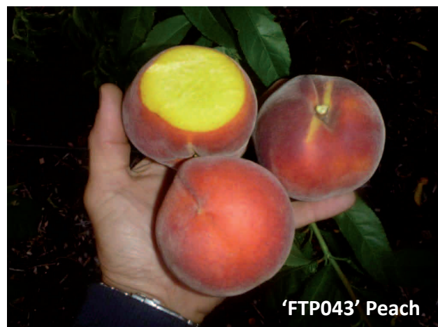
'FTP043' Peach. Stage 2 Evaluation page 7.