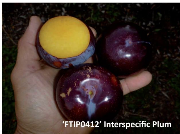
'FTIP0412' Interspecific Plum. Stage 2 Evaluation page 11.