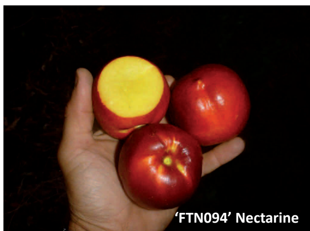
'FTN094' Nectarine. Stage 1 Evaluation page 4.

This edition of The Evaluation Facts contains 11 cultivars listed in order of maturity.