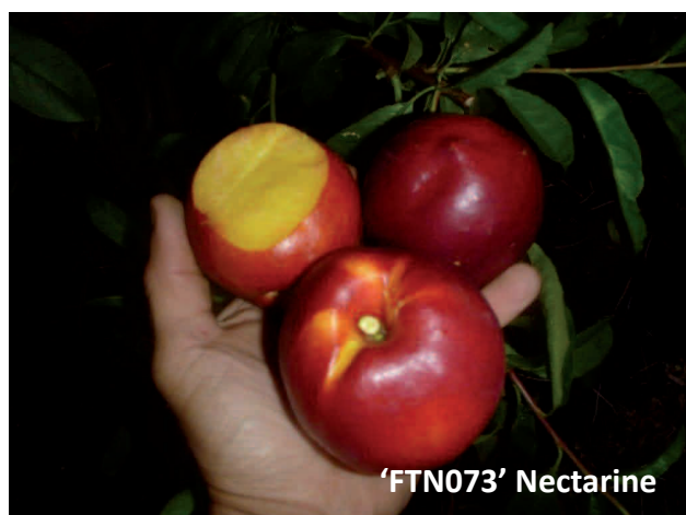
'FTN073' Nectarine . Stage 1 Evaluation page 5.

This project is funded by HAL through voluntary contributions from Graham's Factree Pty Ltd with matched funds from the Australian Government.