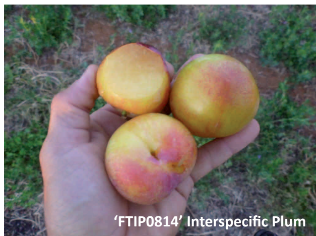
'FTIP0814' Interspecific Plum

'FTP046' Peach. Stage 2 Evaluation page 12.