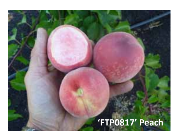
'FTP0817' Peach. Stage 1 Evaluation page 7.

This project is funded by HAL through voluntary contributions from Graham's Factree Pty Ltd with matched funds from the Australian Government.