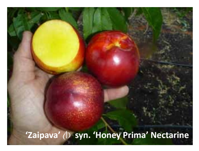
'Zaipava' (D syn. 'Honey Prima' Nectarine. Stage 2 Evaluation page 18.