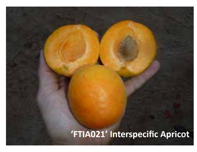
'FTIA021' Interspecific Apricot. Stage 1 Evaluation page 19.