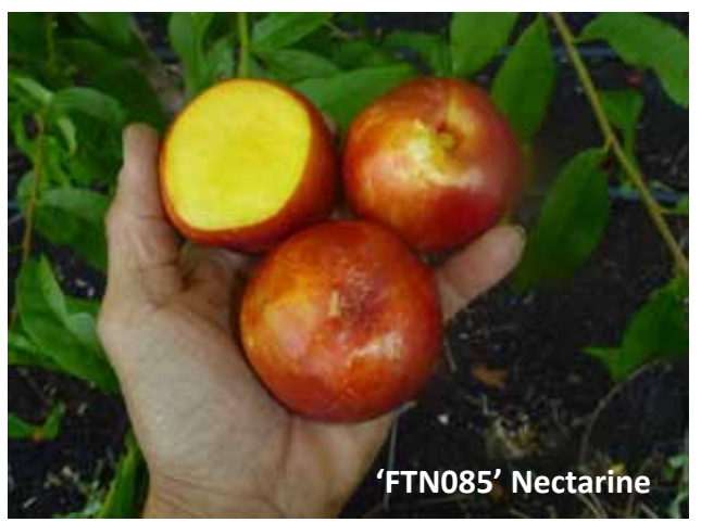
'FTN085' Nectarine. Stage 1 Evaluation page 14.