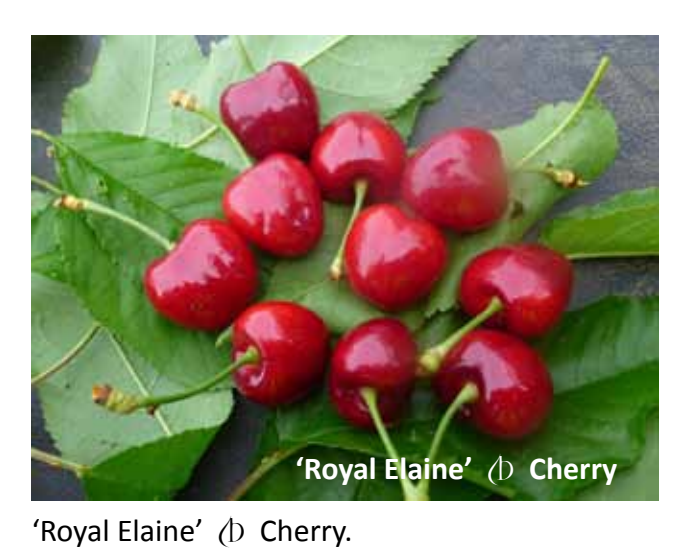
Stage 2 Evaluation page 17.