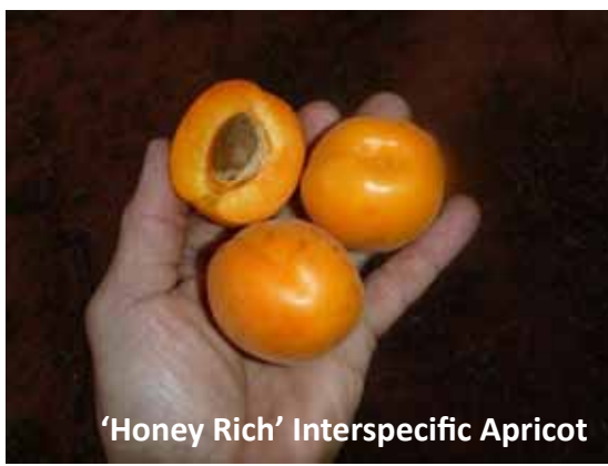
'Honey Rich' Interspecific Apricot. Stage 2 Evaluation page 5.