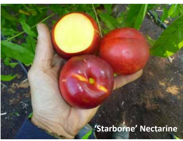
'Starborne' Nectarine. Stage 2 Evaluation page 15.