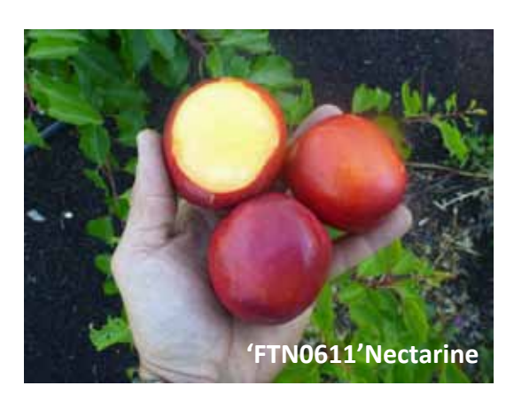
'FTN0611' Nectarine. Stage 1 Evaluation page 6.

PBR(b) Stocking of propagating material of this variety is an infringement under the Australia Plant Bredey's Rights Ada 1994