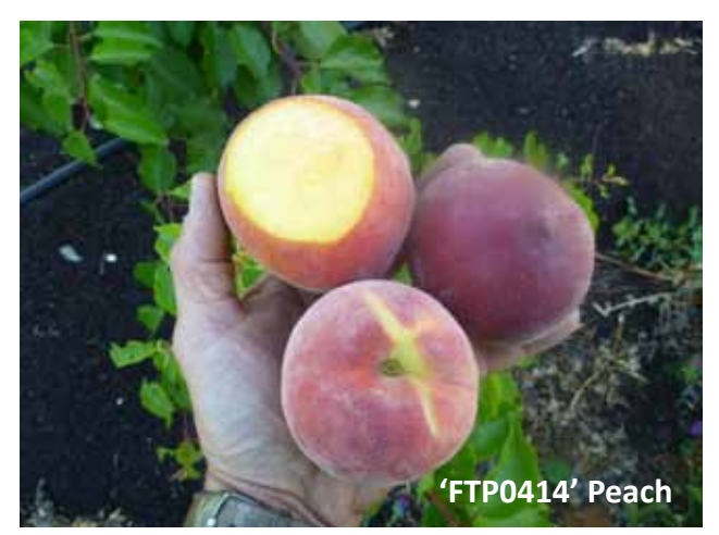
'FTP0414' Peach Stage 2 Evaluation page 8.