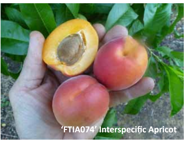
'FTIA074' Interspecific Apricot. Stage 2 Evaluation page 9.