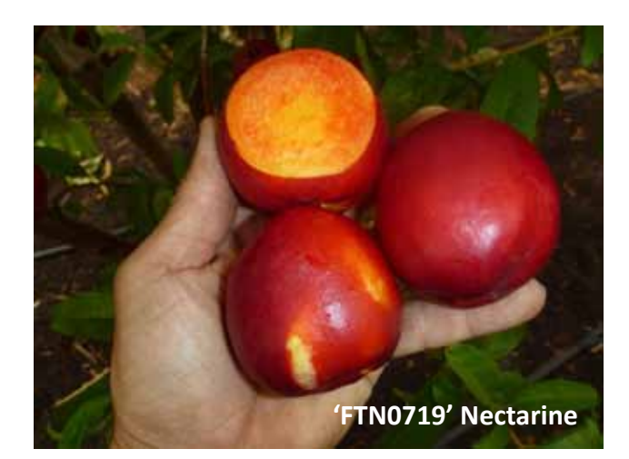
'FTN0719' Nectarine. Stage 2 Evaluation page 12.