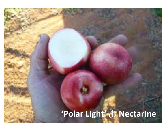
'Polar Light' (D) Nectarine on Okinawa Rootstock. Stage 1 Evaluation page 4.

Welcome to the fourth edition of The Evaluation Facts for the 2012 - 2013 season. The Evaluation Facts is a regular newsletter keeping you in touch with the latest information from the Graham's Factree Cultivar Evaluation Project.