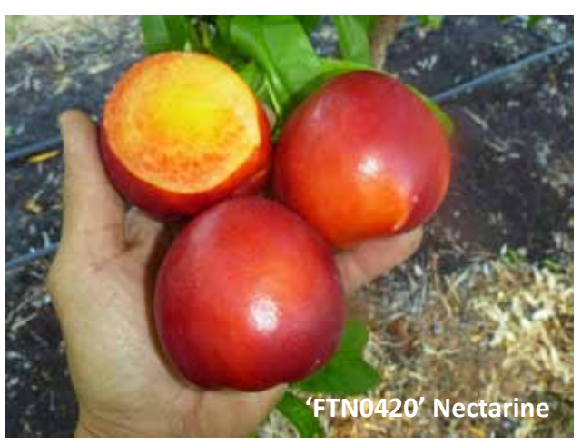
'FTN0420' Nectarine. Stage 2 Evaluation page 16.