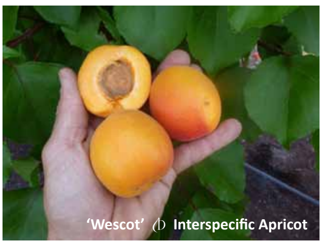
'Wescot' (1) Interspecific Apricot. Stage 2 Evaluation page 10.