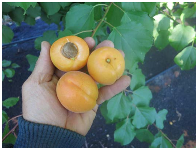
'Honey Rich' Interspecific Apricot – 6.5/10 Stage 2 Evaluation on Page 14