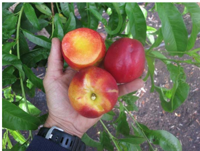
'FTN0420' Nectarine – 5.5/10 Stage 2 Evaluation on Page 15