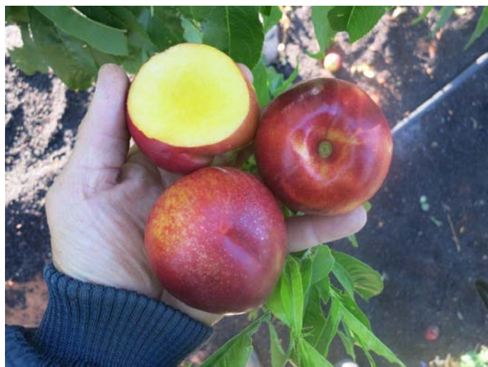
'Honey Prima' (b Nectarine on Okinawa – 7/10 Stage 2 Evaluation on Page 13