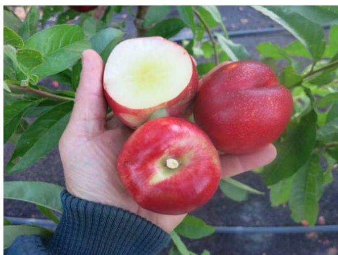
'Spring Heaven' (♂ Nectarine on Nemaguard – 6/10 Stage 2 Evaluation on Page 9