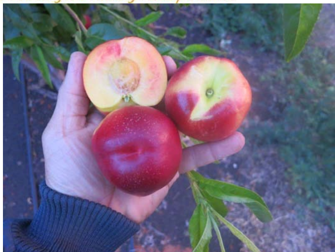
'FTN109' Nectarine – 6.5/10 Stage 2 Evaluation on Page 18