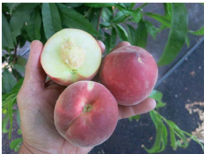
'FTP092' Peach – 5/10 Stage 2 Evaluation on Page 10