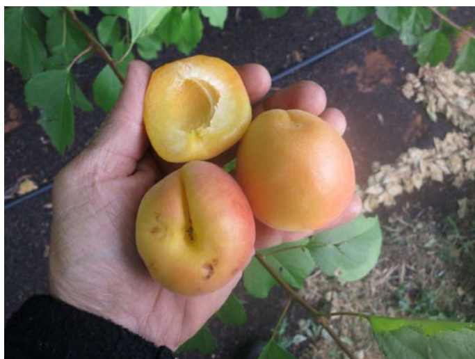
'FTIA086' Interspecific Apricot – 5.5/10 Stage 2 Evaluation on Page 6