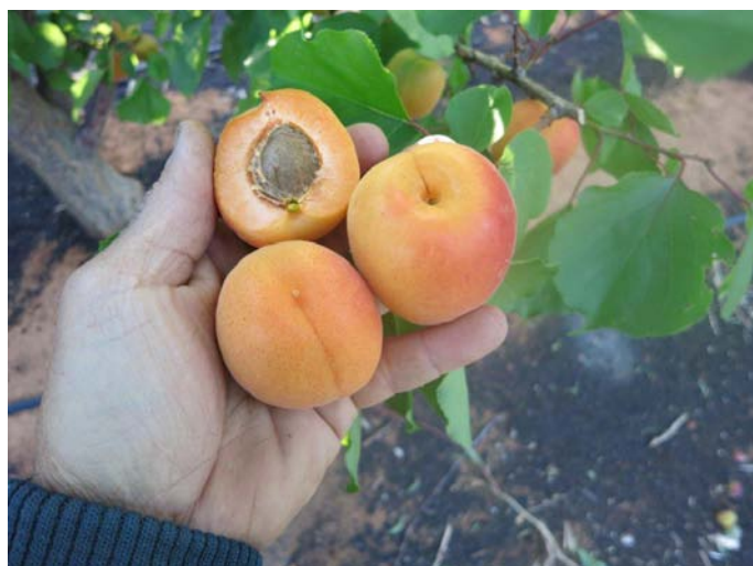
'FTA061' Apricot – 6/10 Stage 2 Evaluation on Page 25