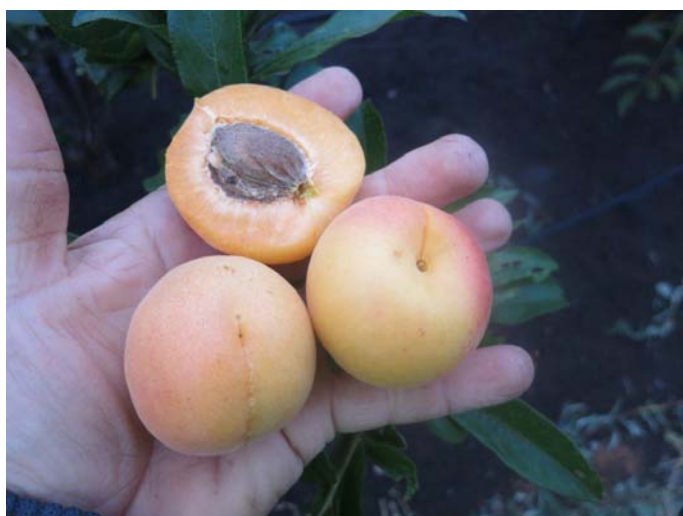
'FTA071' Apricot – 6/10 Stage 2 Evaluation on Page 16