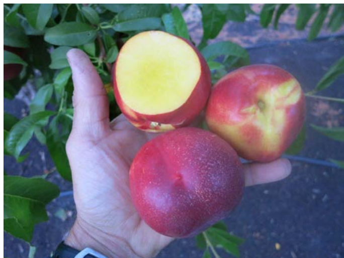
'FTN103' Nectarine – 7.5/10 Stage 2 Evaluation on Page 19