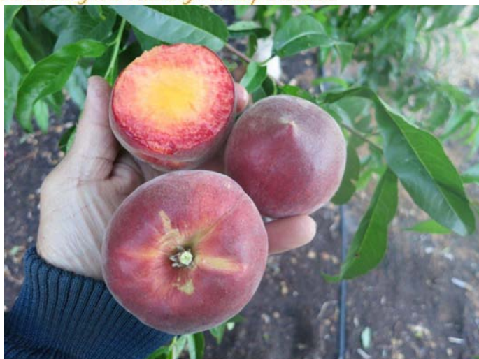
'FTP058' Peach – 5/10 Stage 2 Evaluation on Page 24