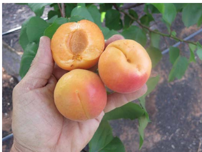
'Wescot' (b Interspecific Apricot – 7/10 Stage 2 Evaluation on Page 17