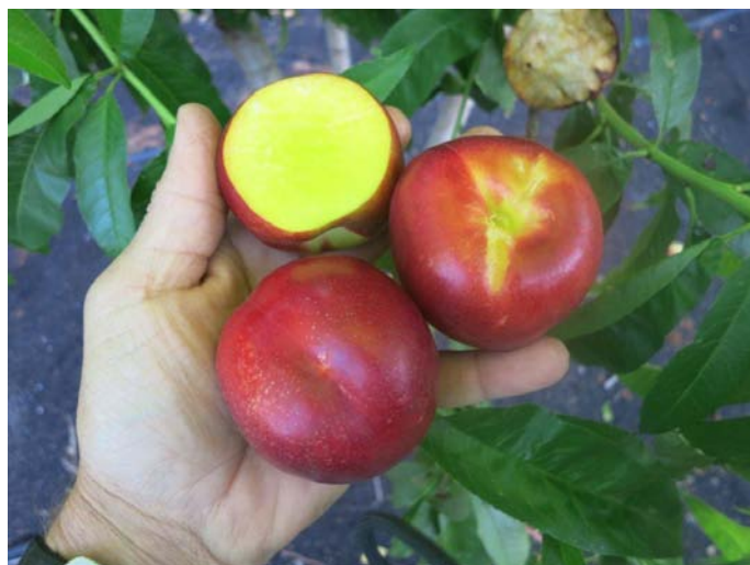
'FTN108' Nectarine – 6.5/10 Stage 2 Evaluation on Page 11