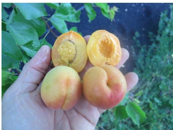
'FTIA048' Interspecific Apricot – 5/10 Stage 2 Evaluation on Page 8