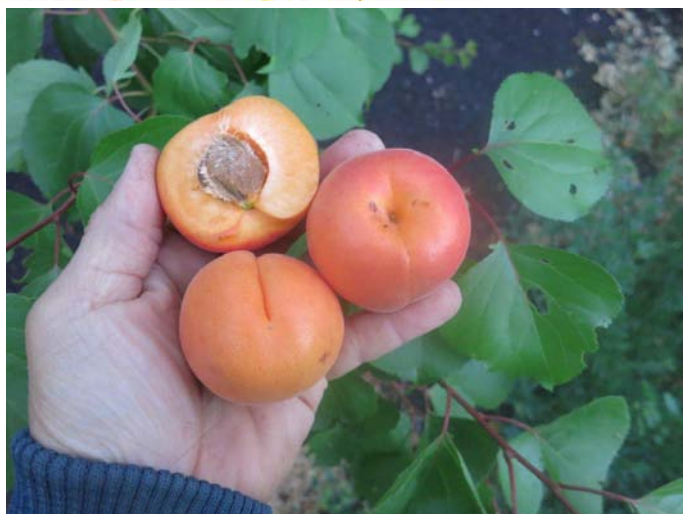
'FTIA082' Interspecific Apricot – 7/10 Stage 2 Evaluation on Page 12