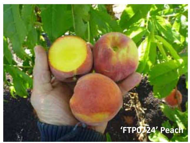
'FTP0724' Peach. Stage 1 Evaluation page 11.

Cultivars are listed in order of maturity.