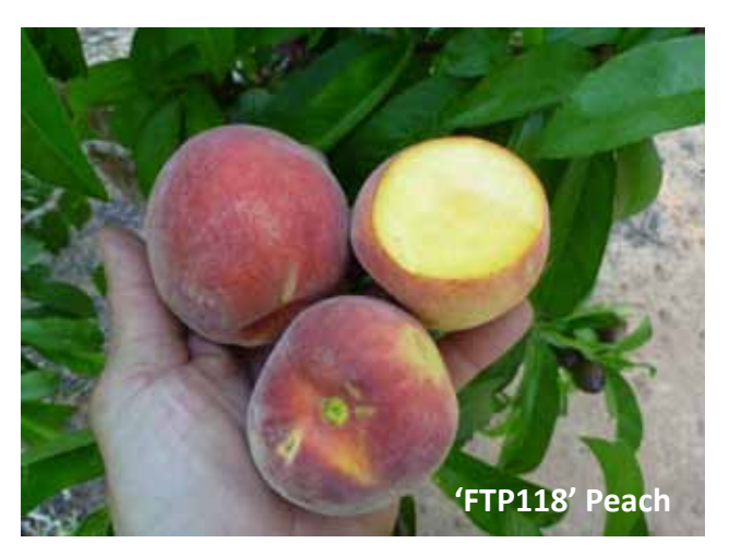
'FTP118' Peach. Stage 1 Evaluation page 18.