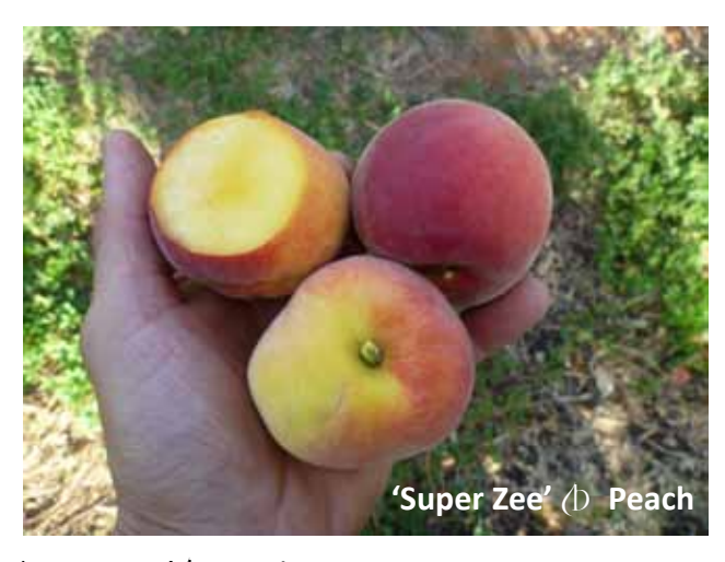
'Super Zee' (D Peach. Stage 2 Evaluation page 14.