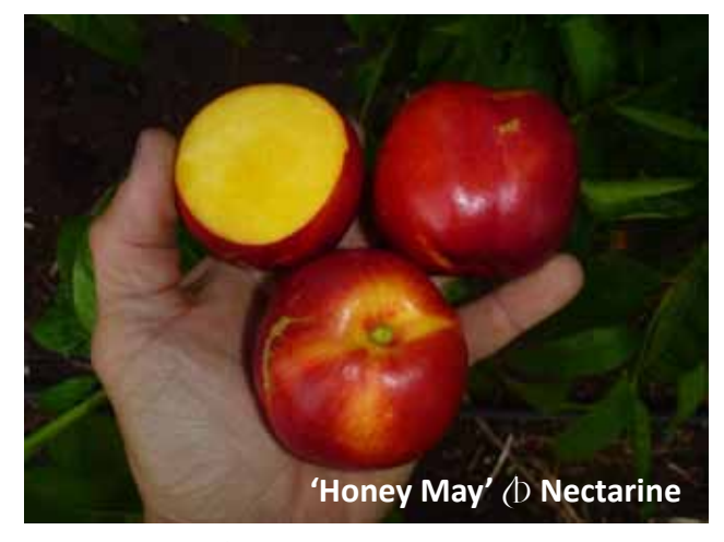
'Honey May' (D Nectarine. Stage 2 Evaluation page 20.