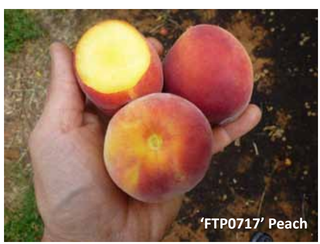
'FTP0717' Peach. Stage 2 Evaluation page 12.