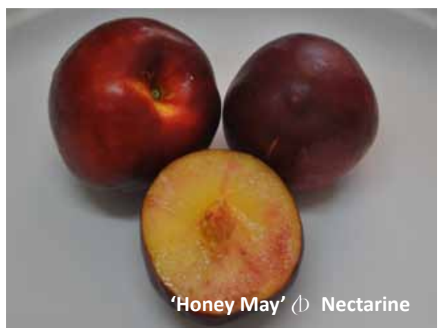
'Honey May' (D) Nectarine on Okinawa Rootstock. Low Chill Region in NSW. Stage 1 Evaluation page 7.