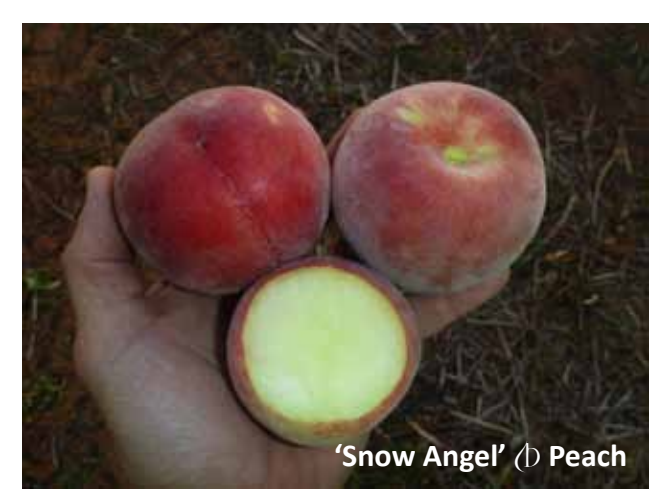
'Snow Angel' (b) Peach. Stage 2 Evaluation page 17.