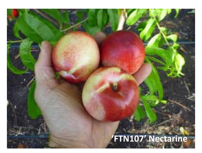
'FTN107' Nectarine. Stage 2 Evaluation page 19.