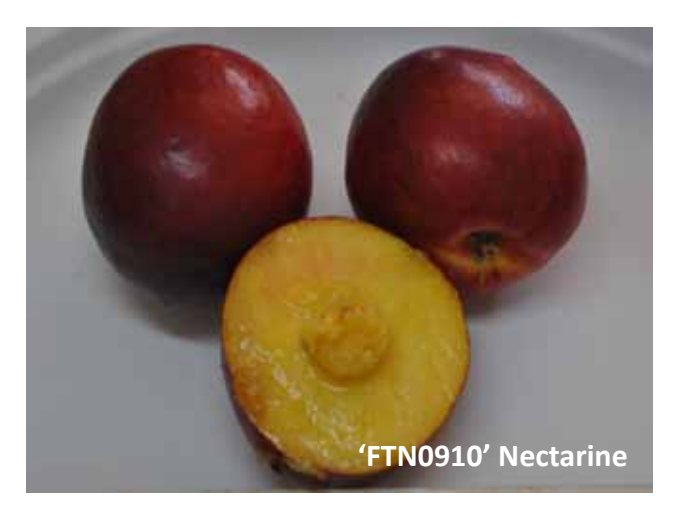
'FTN0910' Nectarine, Low Chill Region in NSW. Stage 1 evaluation page 9.