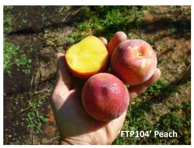
'FTP104' Peach. Stage 2 Evaluation page 8.