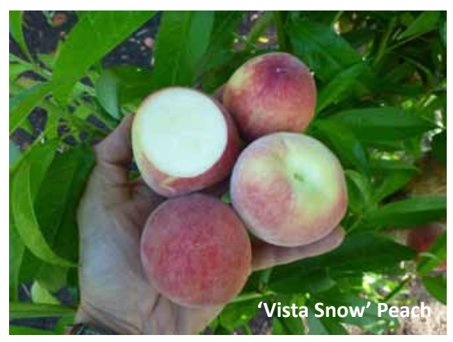
'Vista Snow' Peach. Stage 2 Evaluation page 13.