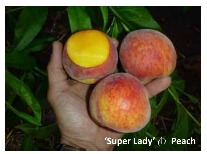
'Super Lady' (D Peach on Nemaguard Rootstock. Stage 2 Evaluation page 16.

PBR(b) Unauthorised commercial propagation or sale, conditioning, export, import or Australias cocking of propagating material of this variety is an infringement under the Plant Breder's Rights Act 1994