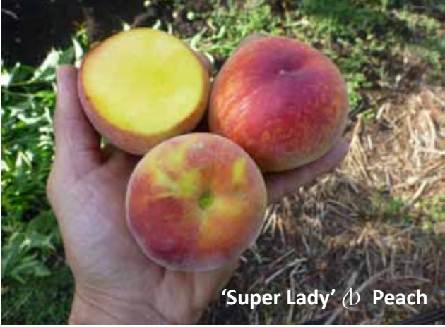
Stage 2 Evaluation page 15.