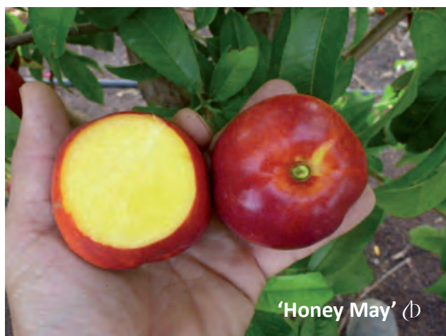
'Honey May' (b) Nectarine. Stage 2 Evaluation page 13.

PBR (b) Unauthorised commercial propagation or sale, conditioning, export, import or stocking of propagating material of this variety is an infringement under the Australia Plant Breeder's Rights Act 1994