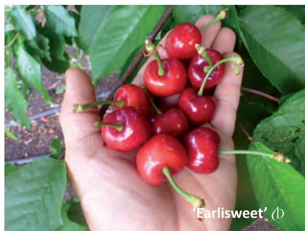
'Earlisweet' (b) Cherry. Stage 2 Evaluation page 14.

PBR (b) Unauthorised commercial propagation or sale, conditioning, export, import or stocking of propagating material of this variety is an infringement under the Australia Plant Breeder's Rights Act 1994