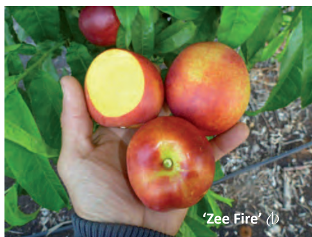
'Zee Fire' (b) Nectarine. Stage 2 Evaluation page 20.

PBR (b) Australia Unauthorised commercial propagation or sale, conditioning, export, import or stocking of propagating material of this variety is an infringement under the Plant Breeder's Rights Act 1994