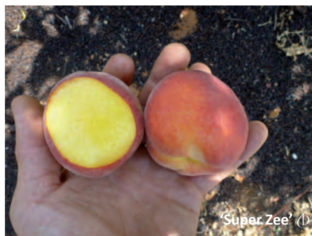
'Super Zee' (b) Peach. Stage 1 Evaluation page 10.

PBR (b) Unauthorised commercial propagation or sale, conditioning, export, import or stocking of propagating material of this variety is an infringement under the Australia Plant Breeder's Rights Act 1994