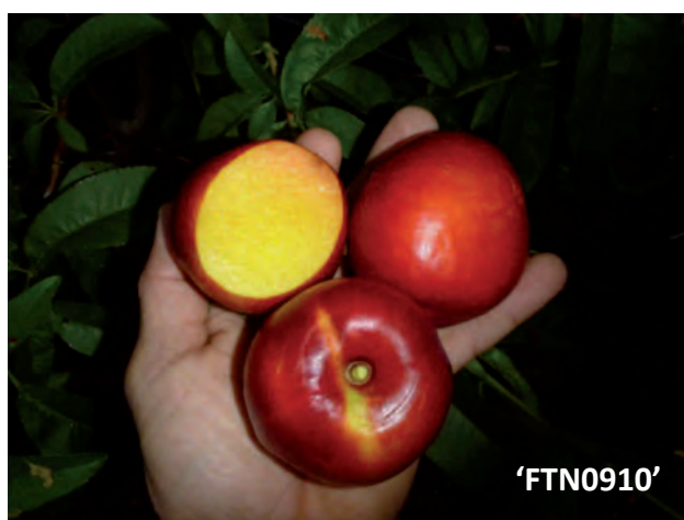
'FTN0910' Nectarine Stage 1 Evaluation page 21.

PBR (b) Australia Unauthorised commercial propagation or sale, conditioning, export, import or stocking of propagating material of this variety is an infringement under the Plant Breeder's Rights Act 1994