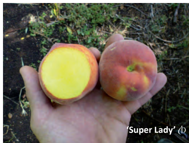
'Super Lady' (b) Peach on 'Nemaguard' rootstock. Stage 2 Evaluation page 6.

PBR (b) Unauthorised commercial propagation or sale, conditioning, export, import or stocking of propagating material of this variety is an infringement under the Australia Plant Breeder's Rights Act 1994