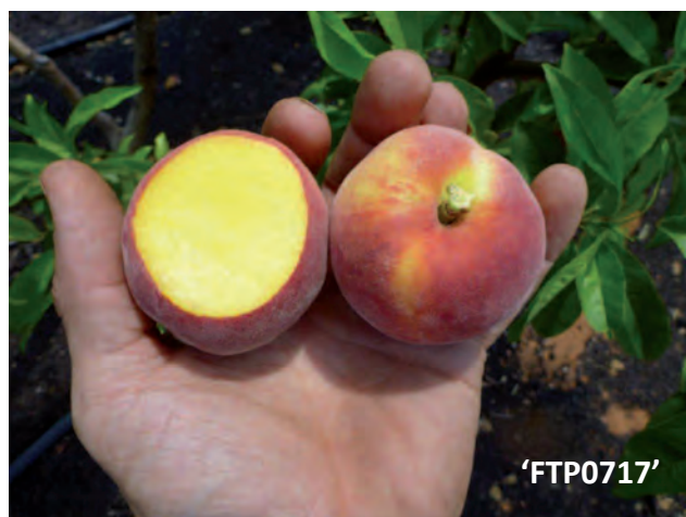
'FTP0717' Peach. Stage 1 Evaluation page 11.