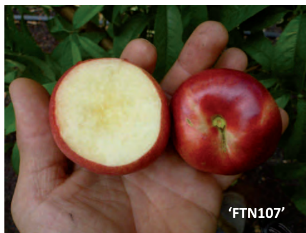
'FTN107' Nectarine. Stage 1 Evaluation page 12.