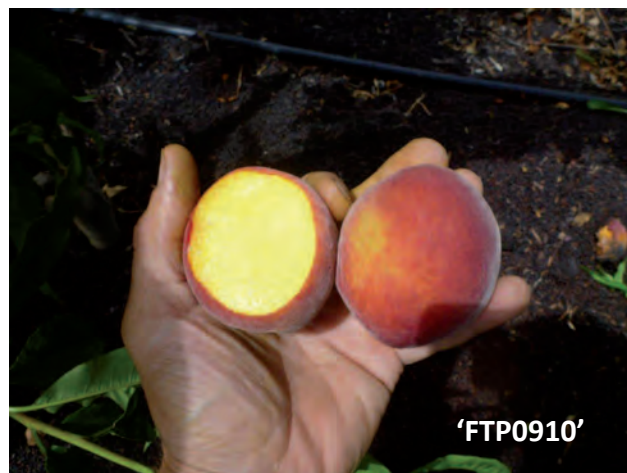
'FTP0910' Peach. Stage 1 Evaluation page 18.