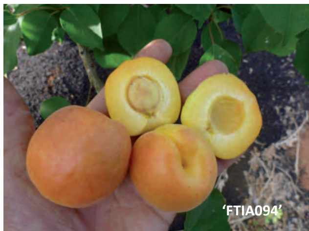
'FTIA094' Interspecific Apricot Stage 1 Evaluation page 17.