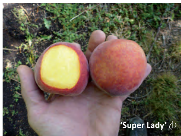
'Super Lady' (b) Peach on 'Flordagard' rootstock. Stage 2 Evaluation page 7.

PBR (b) Unauthorised commercial propagation or sale, conditioning, export, import or stocking of propagating material of this variety is an infringement under the Australia Plant Breeder's Rights Act 1994