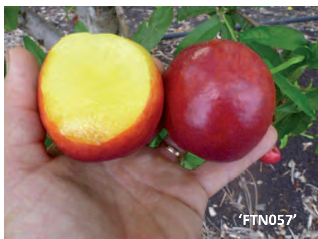
'FTN057' Nectarine. Stage 2 Evaluation page 15.

PBR (b) Unauthorised commercial propagation or sale, conditioning, export, import or stocking of propagating material of this variety is an infringement under the Australia Plant Breeder's Rights Act 1994