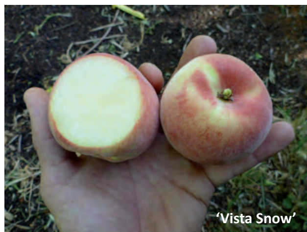
'Vista Snow' Peach. Stage 2 Evaluation page 8.

PBR (b) Unauthorised commercial propagation or sale, conditioning, export, import or stocking of propagating material of this variety is an infringement under the Australia Plant Breeder's Rights Act 1994