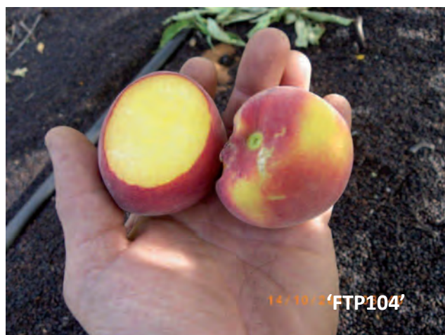
'FTP104' Peach. Stage 1 Evaluation page 5.