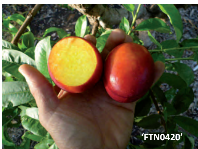
'FTN0420' Nectarine. Stage 2 Evaluation page 19.