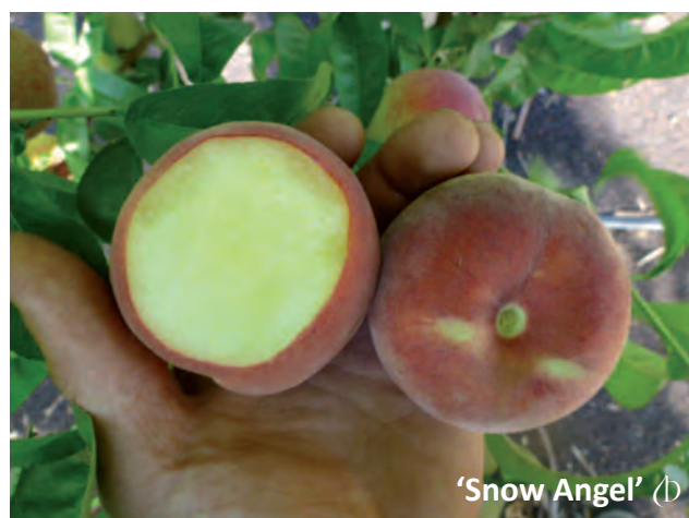
'Snow Angel' (b) Peach. Stage 2 Evaluation page 9.

PBR (b) Unauthorised commercial propagation or sale, conditioning, export, import or stocking of propagating material of this variety is an infringement under the Australia Plant Breeder's Rights Act 1994