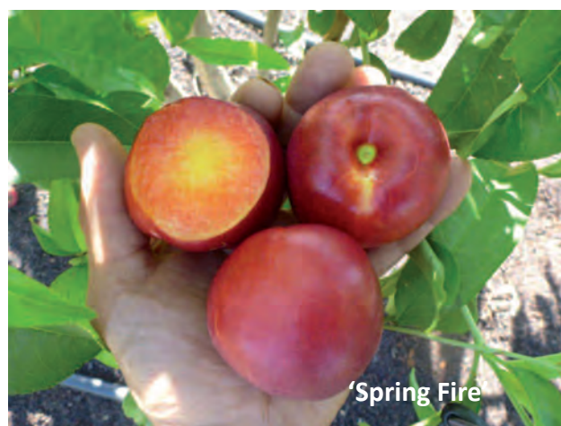
'Spring Fire' Nectarine. Stage 2 Evaluation page 16.