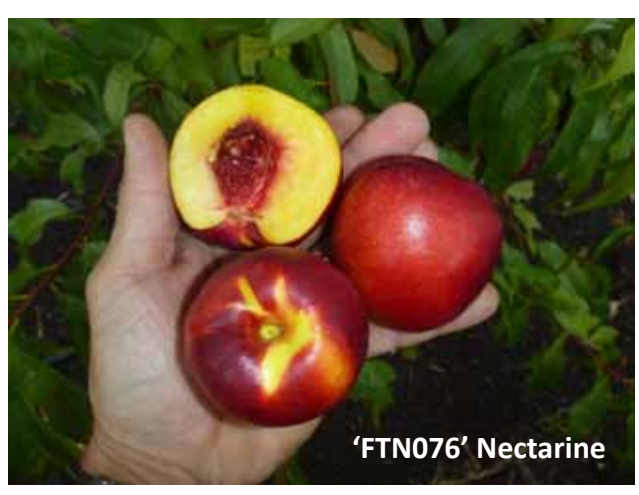
'FTN076' Nectarine. Stage 1 Evaluation page 16.