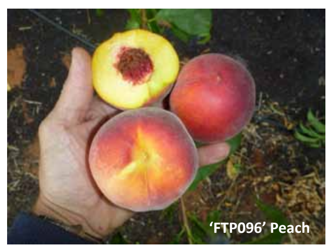
'FTP096' Peach. Stage 2 Evaluation page 17.