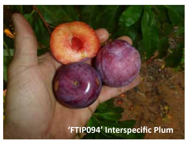
'FTIP094' Interspecific Plum. Stage 1 Evaluation page 18.