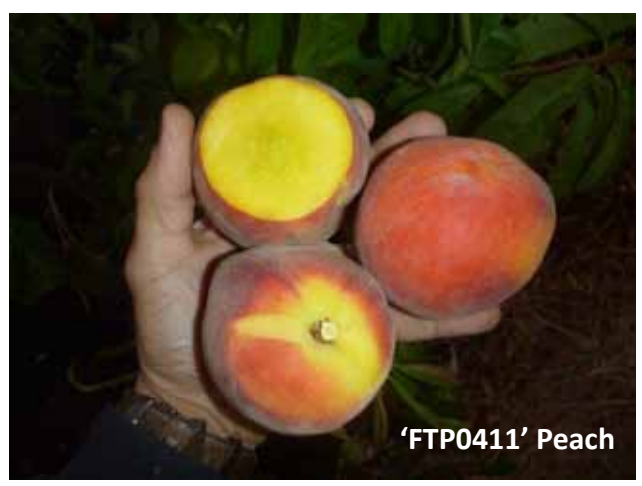
'FTP0411' Peach. Stage 1 Evaluation page 10.