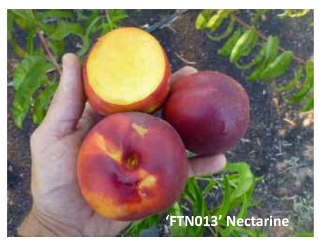
'FTN013' Nectarine. Stage 1 Evaluation page 24.