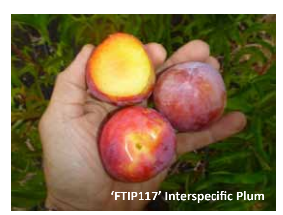
'FTIP117' Interspecific Plum. Stage 1 Evaluation page 7.