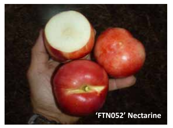
'FTN052' Nectarine. Stage 1 Evaluation page 8.

This \ project \ is \ funded \ by \ HAL \ through \ voluntary \ contributions \ from \ Graham's \ Factree \ Pty \ Ltd \ with \ matched \ funds \ from \ the \ Australian \ Government.