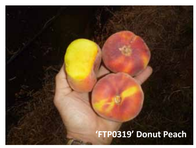
'FTP0319' Donut Peach. Stage 1 Evaluation page 12.