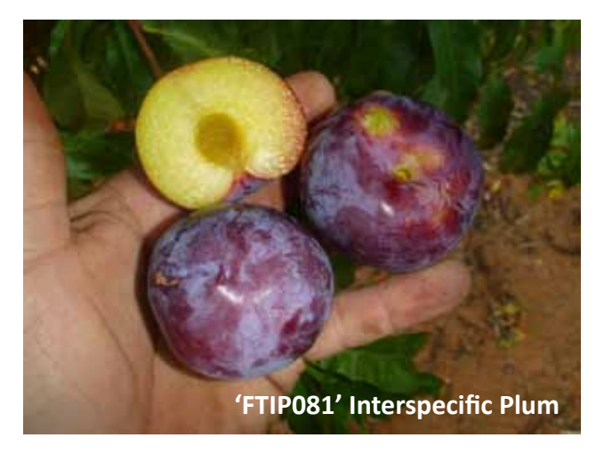
'FTIP081' Interspecific Plum. Stage 1 Evaluation page 19.