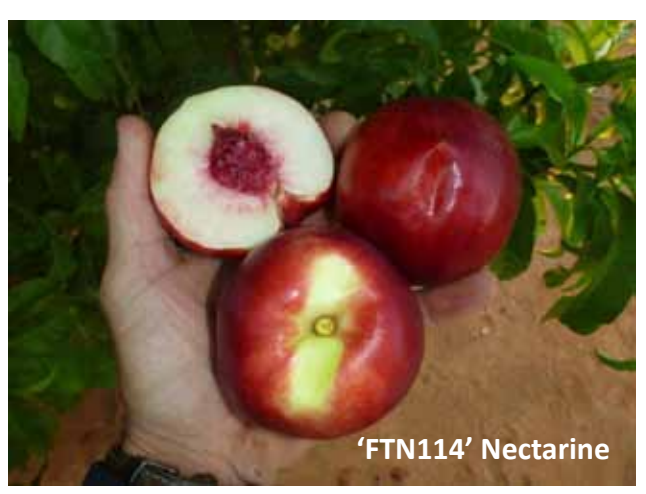
'FTN114' Nectarine. Stage 1 Evaluation page 22.