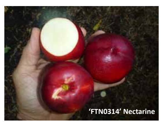
'FTN0314' Nectarine. Stage 1 Evaluation page 5.

Welcome to the thirteenth edition of The Evaluation Facts for the 2012 - 2013 season. The Evaluation Facts is a regular newsletter keeping you in touch with the latest information from the Graham's Factree Cultivar Evaluation Project.