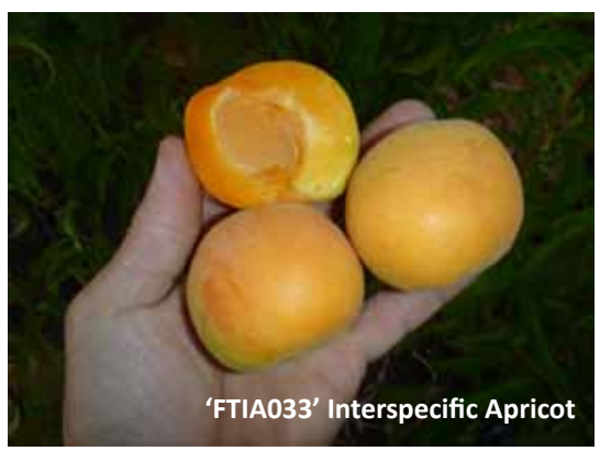
'FTIA033' Interspecific Apricot. Stage 1 Evaluation page 6.