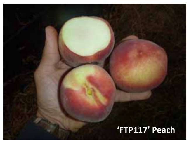
'FTP117' Peach. Stage 1 Evaluation page 15.