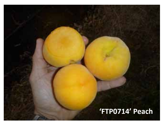
'FTP0714' Peach. Stage 2 Evaluation page 9.