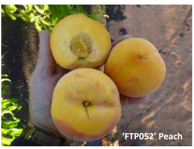
'FTP052' Peach. Stage 2 Evaluation page 23.