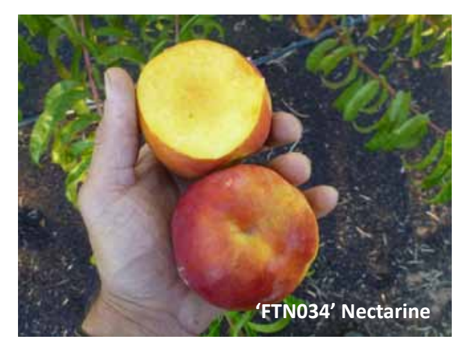
'FTN034' Nectarine. Stage 1 Evaluation page 26.