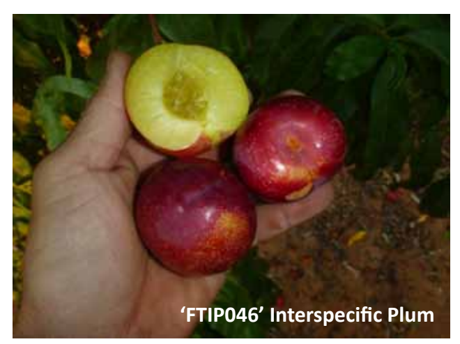
'FTIP046' Interspecific Plum. Stage 1 Evaluation page 21.