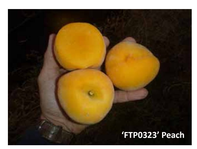
'FTP0323' Peach. Stage 1 Evaluation page 13.