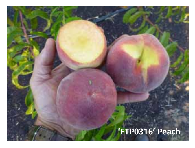
'FTP0316' Peach. Stage 1 Evaluation page 25.