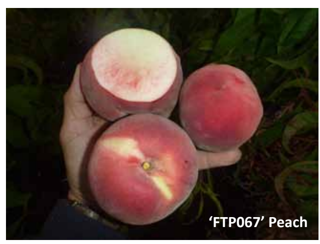
'FTP067' Peach. Stage 1 Evaluation page 11.