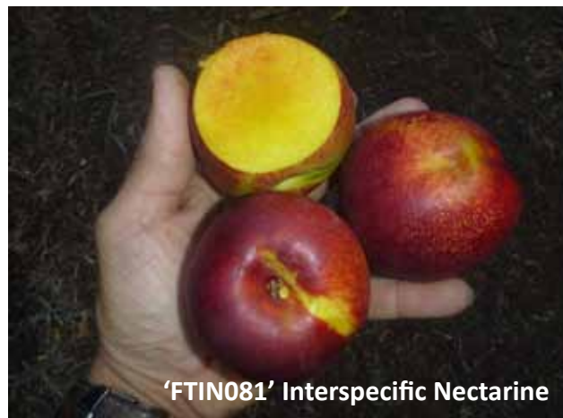
'FTIN081' Interspecific Nectarine

'FTPC101' Interspecific Plum Cherry. Stage 2 Evaluation page 21.