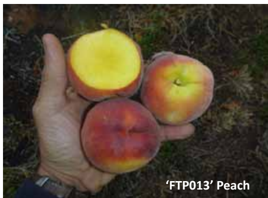
'FTP013' Peach. Stage 1 Evaluation page 5.

Welcome to the eleventh edition of The Evaluation Facts for the 2012 - 2013 season. The Evaluation Facts is a regular newsletter keeping you in touch with the latest information from the Graham's Factree Cultivar Evaluation Project.