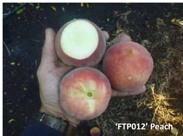
'FTP012' Peach. Stage 1 Evaluation page 14.