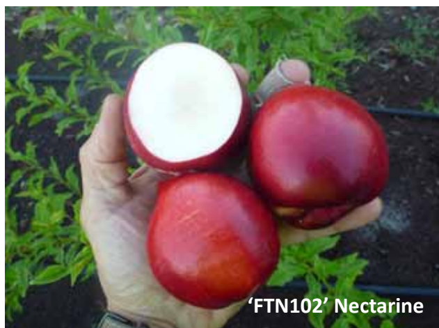
'FTN102' Nectarine. Stage 2 Evaluation page 9.