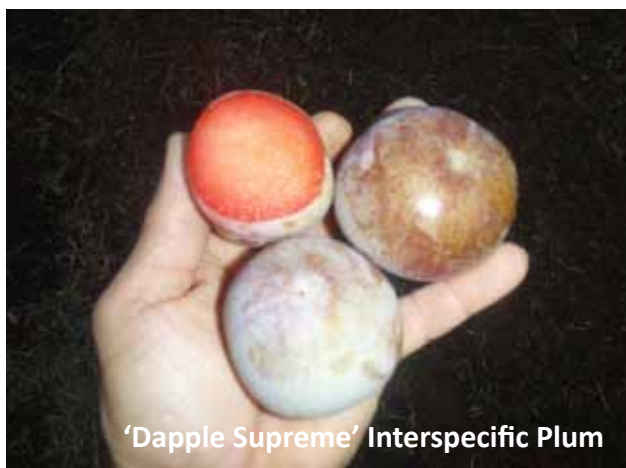
'Dapple Supreme' Interspecific Plum

'FTIP1011' Interspecific Plum. Stage 1 Evaluation page 19.