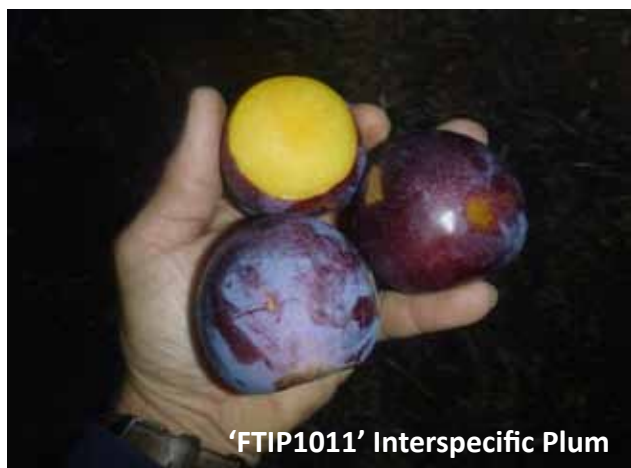
'FTIP1011' Interspecific Plum

'Sweet Blaze' Peach. Stage 1 Evaluation page 18.