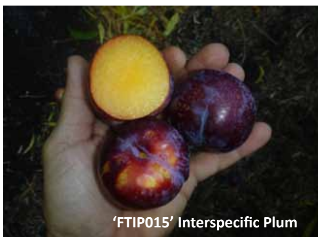
'FTIP015' Interspecific Plum

'FTP0710' Peach. Stage 2 Evaluation page 25.