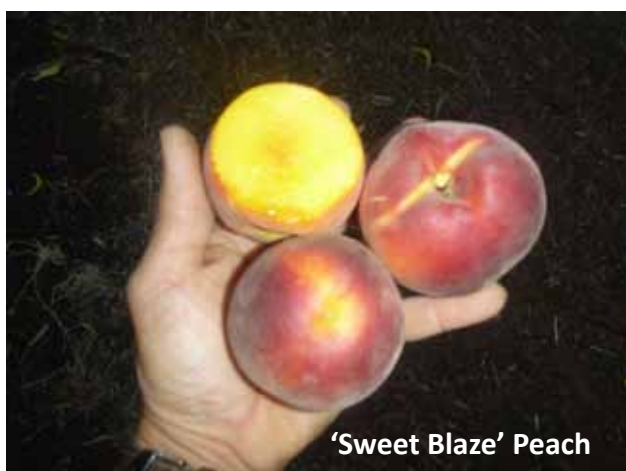
'Sweet Blaze' Peach

'FTN049' Nectarine. Stage 2 Evaluation page 17.