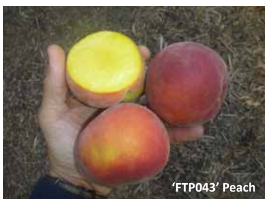
'FTP043' Peach. Stage 2 Evaluation page 8.

This project is funded by HAL through voluntary contributions from Graham's Factree Pty Ltd with matched funds from the Australian Government.