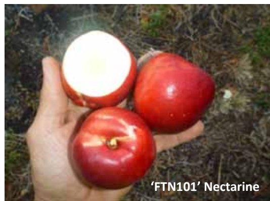
'FTN101' Nectarine. Stage 2 Evaluation page 6.