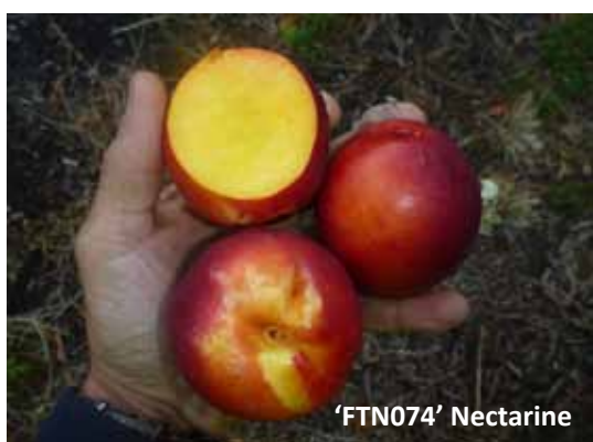
'FTN074' Nectarine. Stage 2 Evaluation page 7.