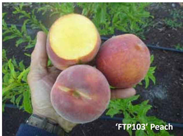
'FTP103' Peach. Stage 2 Evaluation page 11.