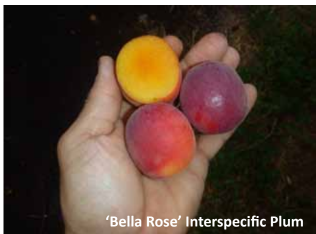
'Bella Rose' Interspecific Plum

'FTIN081' Interspecific Nectarine. Stage 1 Evaluation page 22.