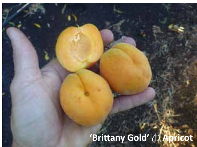
'Brittany Gold' (b) Apricot. Stage 1 Evaluation page 13.