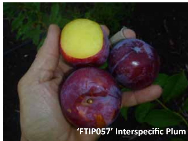
'FTIP057' Interspecific Plum. Stage 1 Evaluation page 12.