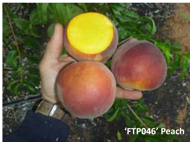
'FTP046' Peach. Stage 2 Evaluation page 10.