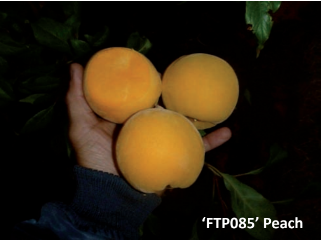
'FTP085' Peach. Stage 1 Evaluation page 18.