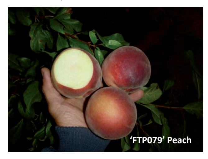
'FTP079' Peach . Stage 2 Evaluation page 19.