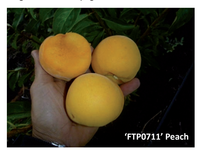
'FTP0711' Peach. Stage 1 Evaluation page 7.

This \ project \ is \ funded \ by \ HAL \ through \ voluntary \ contributions \ from \ Graham's \ Factree \ Pty \ Ltd \ with \ matched \ funds \ from \ the \ Australian \ Government.