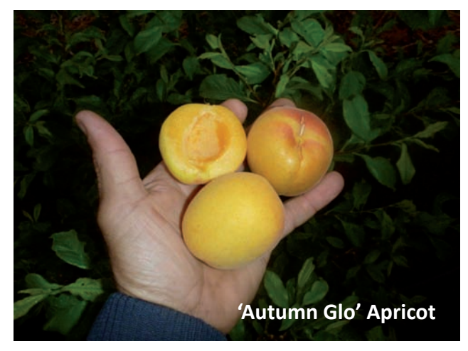
'Autumn Glo' Apricot. Stage 2 Evaluation page 13.