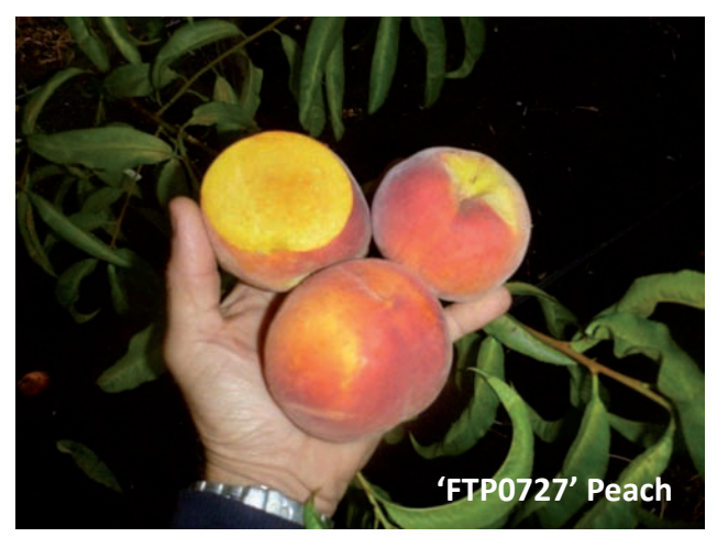
'FTP0727' Peach. Stage 1 Evaluation page 10.