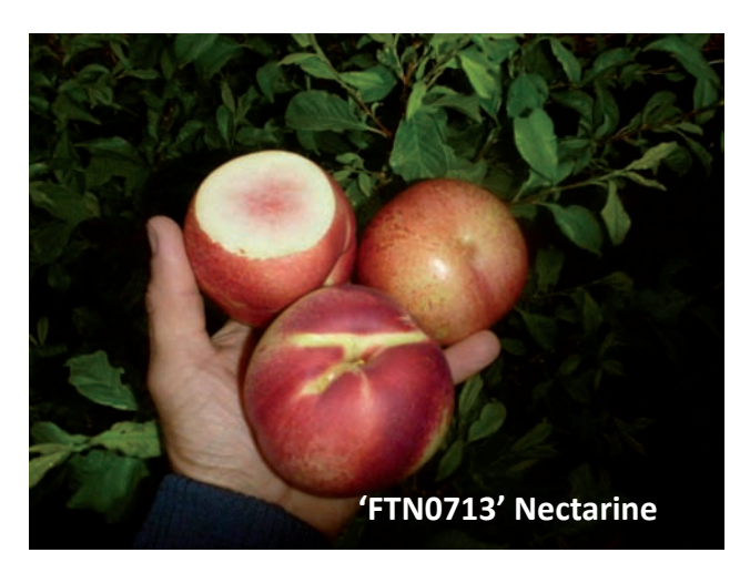
'FTN0713' Nectarine. Stage 2 Evaluation page 12.