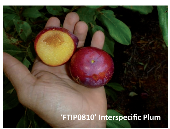
'FTIP0810' Interspecific Plum. Stage 1 Evaluation page 9.