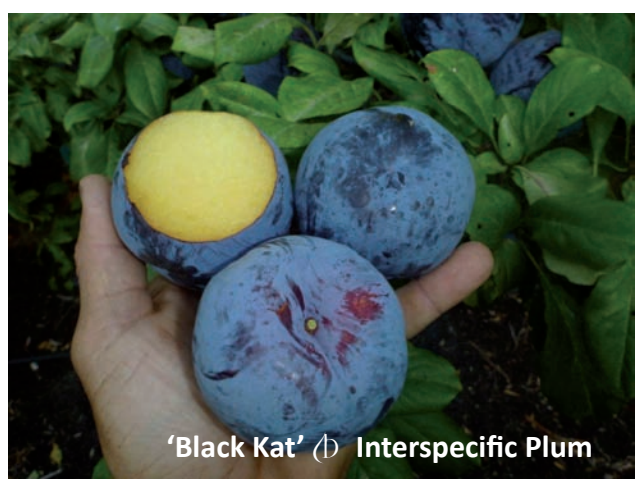
'Black Kat' (1) Interspecific Plum. Stage 2 Evaluation page 16.