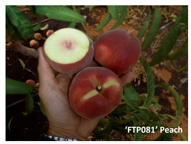
'FTP081' Peach. Stage 1 Evaluation page 11.