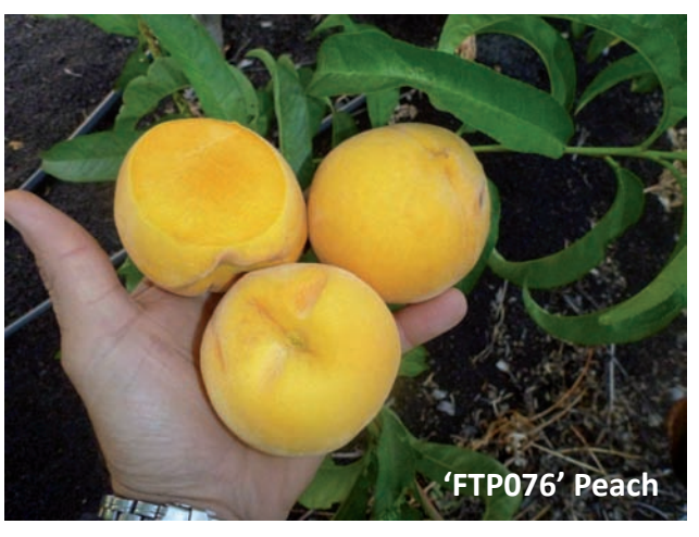
'FTP076' Peach. Stage 1 Evaluation page 5.