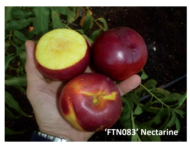
'FTN083' Nectarine. Stage 2 Evaluation page 4.

Welcome to the eleventh edition of The Evaluation Facts for the 2011-2012 season. The Evaluation Facts is a regular newsletter keeping you in touch with the latest information from Graham's Factree's Cultivar Evaluation Project.