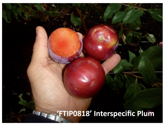
'FTIP0818' Interspecific Plum. Stage 1 Evaluation page 8.