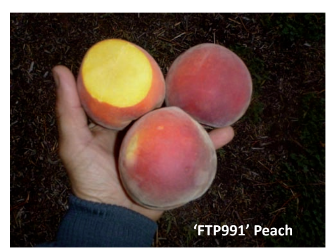
'FTP991' Peach. Stage 2 Evaluation page 14.