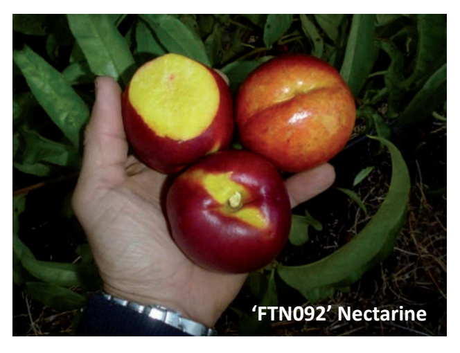
'FTN092' Nectarine. Stage 1 Evaluation page 6.