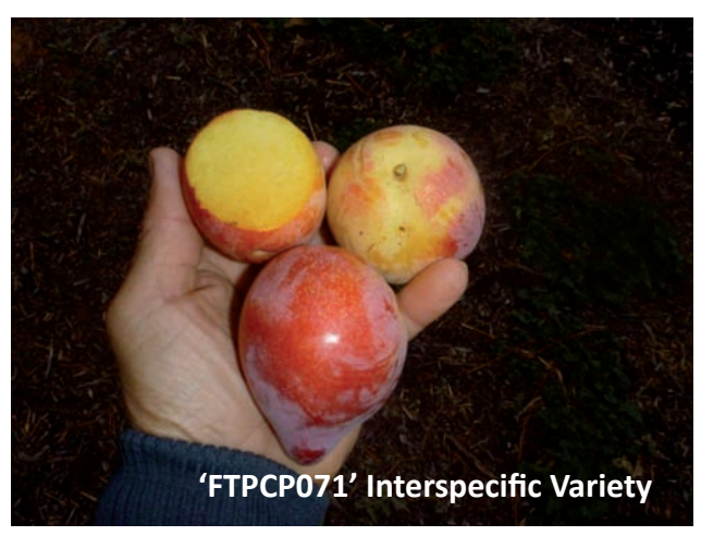
'FTPCP071' Interspecific Variety. Stage 1 Evaluation page 15.